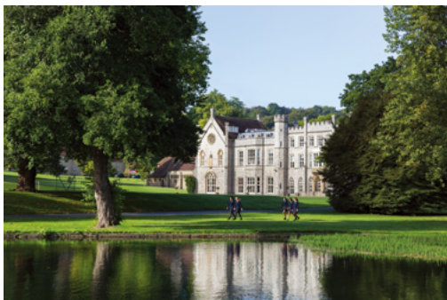
Wycombe Abbey School